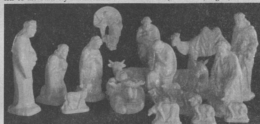
This is the 20-piece glazed ceramic nativity scene being offered by the Parish of the Nativity.